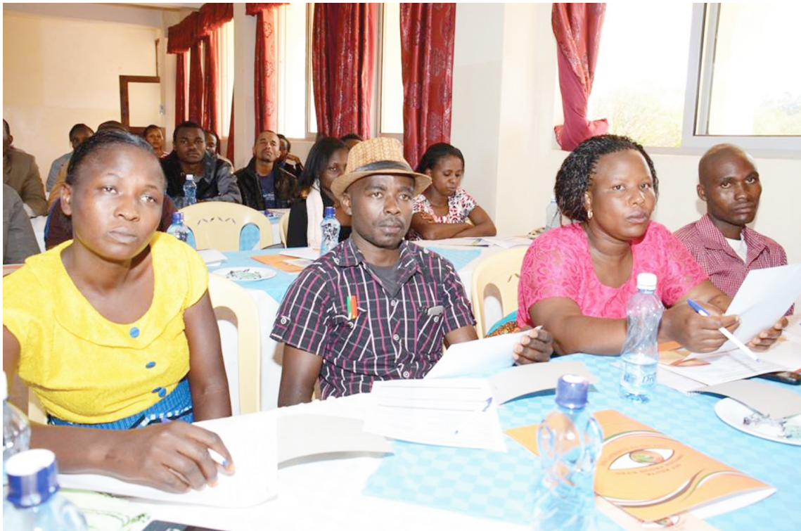
Taita Taveta County youth leaders at the Coast Institute of Technology, Voi where they participated in a sensitization and capacity building workshop.

The National and County Governments in the six counties fully supported the workshops and provided high ranking officials to facilitate the official opening ceremonies. The officials lauded the initiative by NACCSC to target the vulnerable sector of society, the youth, that constantly bears the brunt of corruption as they transitioned from schools and colleges into the job market. The youth were challenged to embrace and practice positive values, involve themselves in gainful employment through various empowerment initiatives by the National and County Governments, avoid being idle and vulnerable to crime and to promote transparency in their undertakings as ways of fighting corruption.