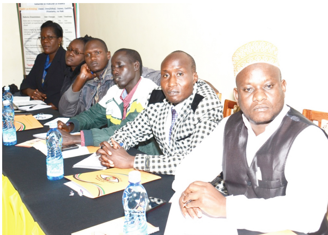
A section of the newly appointed CACCOC members drawn from three counties during a workshop to build their capacity.