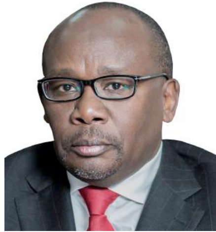
Hon. Prof. Githu Muigai E.G.H., SC Attorney-General of the Republic of Kenya