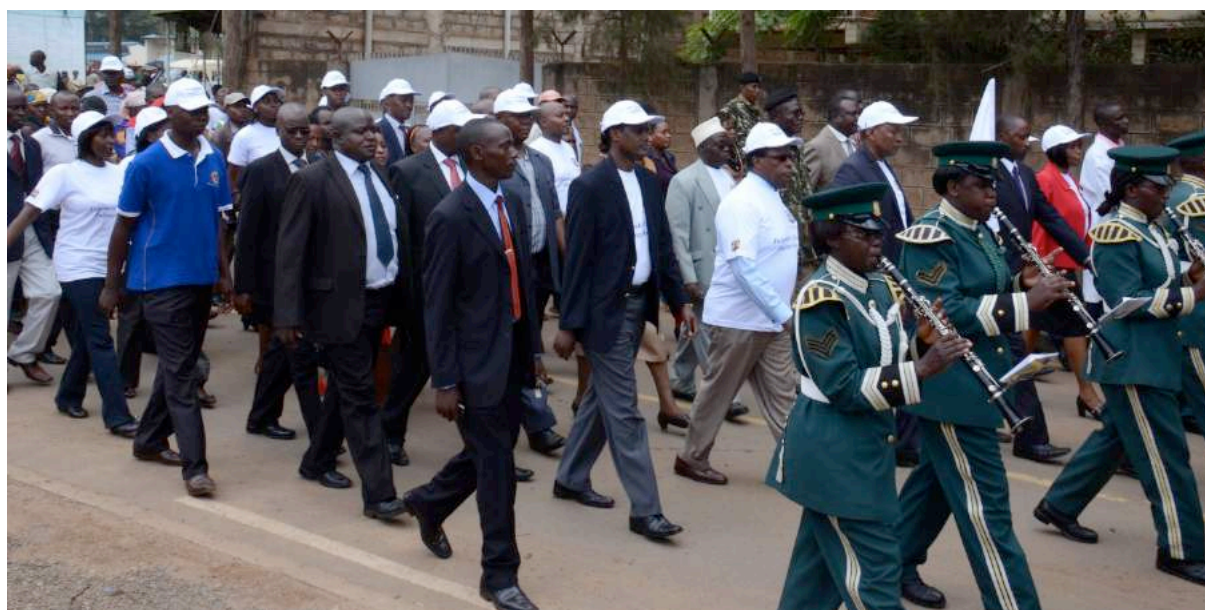
A cross-section of participants march along the streets of Machakos Town during festivities to mark the UN International Anti-Corruption Day on 9 th December, 2014

NACCSC through the County Anti-Corruption Civilian Oversight Committees (CACCOCs) also participated in activities organized regionally to mark the Day in Kilifi, Kirinyaga and Bungoma Counties. CACCOCs Chairpersons and Regional Anti-Corruption Co-ordinators facilitated build-up activities like radio talk shows and road shows and also addressed the gatherings to pass anti-corruption messages.