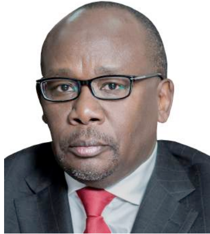
Hon. Prof. Githu Muigai, E.G.H., SC Attorney-General of the Republic of Kenya