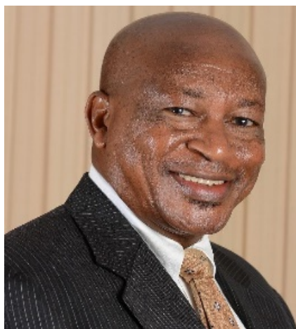
Hon. P. Kihara Kariuki C.B.S Attorney-General of the Republic of Kenya