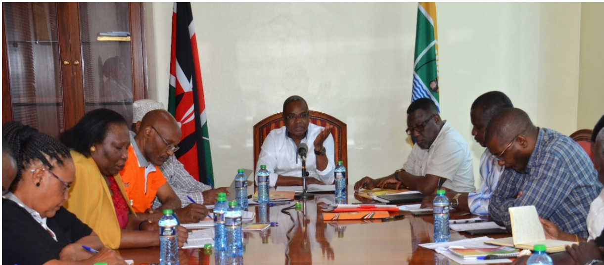
Kilifi County Governor, H.E Hon. Amason Kingi, chairing the policy meeting with NACCSC Members held in Kilifi County. H.E Kingi urged the National Government to invest resources in the preventive approach so as to win the fight against corruption

The meetings were very fruitful and the two levels of Government promised to support and participate in the campaign and also appoint Liaison Officers who would be the link between the CACCOCs and the Governments. They said that more emphasis should be laid on prevention of corruption, hence the need for more resources. Details of the outcome of the meetings are in appendix IV.