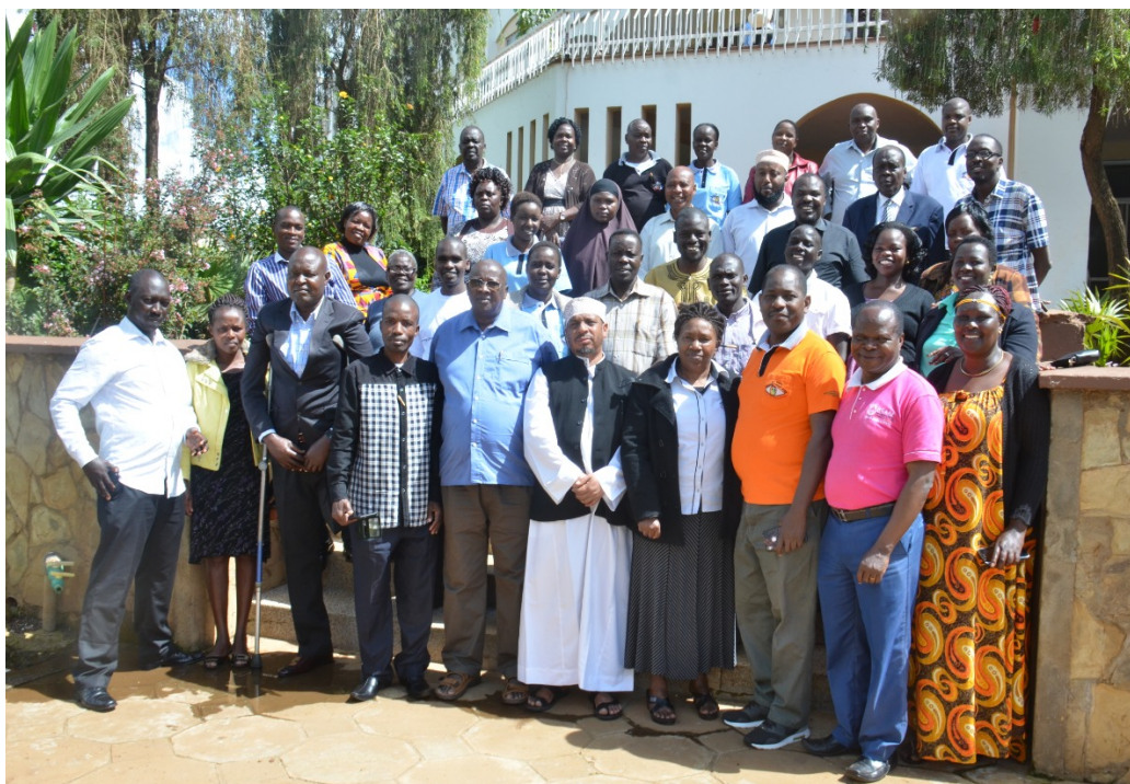
A group photo of participants that were trained by the World Bank under the Kenya Accountable Devolution Programme at the Sirikwa Hotel in Eldoret. Participants were drawn from Uasin Gishu, Elgeyo Marakwet, Trans Nzoia and West Pokot counties

The draft National Anti-Corruption Campaign Council (NACCC) Bill being developed by the Kenya Law Reform Commission to anchor NACCSC in the law was submitted to the Hon. Attorney General (AG) on 27th February, 2019 for clearance. The Hon. AG considered and approved the draft Bill to proceed to the next stage of stakeholders’ review and validation. NACCSC then distributed the bill to the stakeholders, with a request that they provide their views.