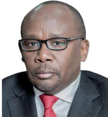
Hon. Prof. Githu Muigai E.G.H., SC Attorney General of the Republic of Kenya