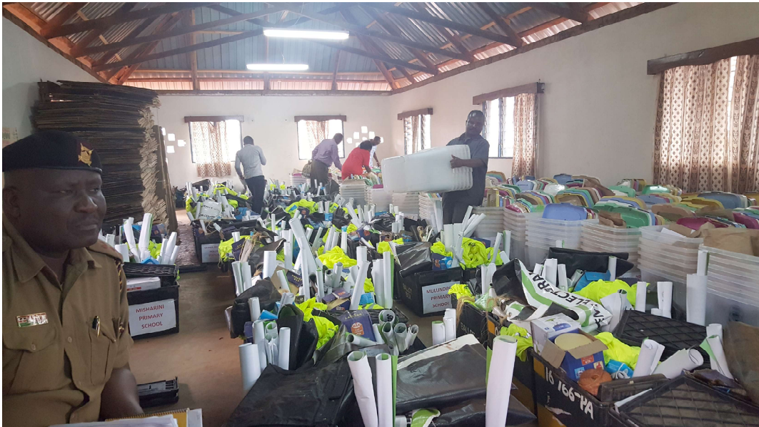
Elections materials, under tight security, being prepared by IEBC personnel for distribution to polling stations within Voi Constituency on the eve of the 8 th August 2017 general election

provided by IEBC to facilitate the exercise. The electoral process was observed for an aggregate period of 10 days beginning on 24 th July, 2017 and covered the pre-polling, polling and post polling periods.