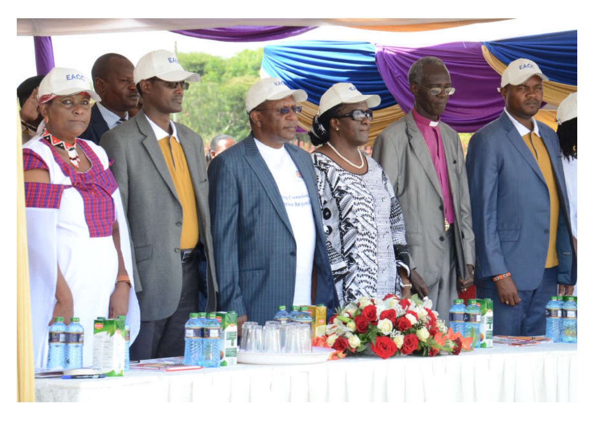
Dignitaries sing the national anthem during the International Anti-Corruption Day Commemoration held at the KCB Grounds, Kajiado County. Standing second right is the NACCSC Chairperson Archbishop (Rtd) Eliud Wabukala