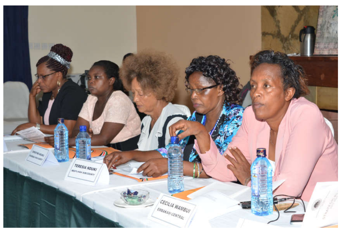
Maendeleo Ya Wanawake Organization Leaders from Nairobi City County during a sensitization workshop to equip them with skills to enable them reach out to grassroots women and enlist them in the fight against corruption

NACCSC did not have sufficient funds to mount sensitization workshops for women leaders in the sub-counties as well produce sufficient IEC materials for distribution.