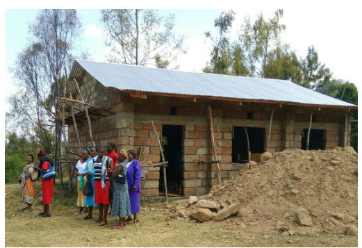
An incomplete classroom at Rurama Secondary School in Nkumbo Location, Imenti South Sub-County, funded to the tune of KShs 500,000

Participants were sensitized on what corruption is, types and effects; stages in the project cycle, how corruption affects the projects and the preventive measures available to the public such as ensuring that project management committees were elected, adequate information on funds allocated, sources duration of implementation was provided, but most importantly, ensure that they do not participate or aid in theft of materials from the sites by unscrupulous contractors and public officials. Social audits help illustrate to the public how corruption affects public projects.