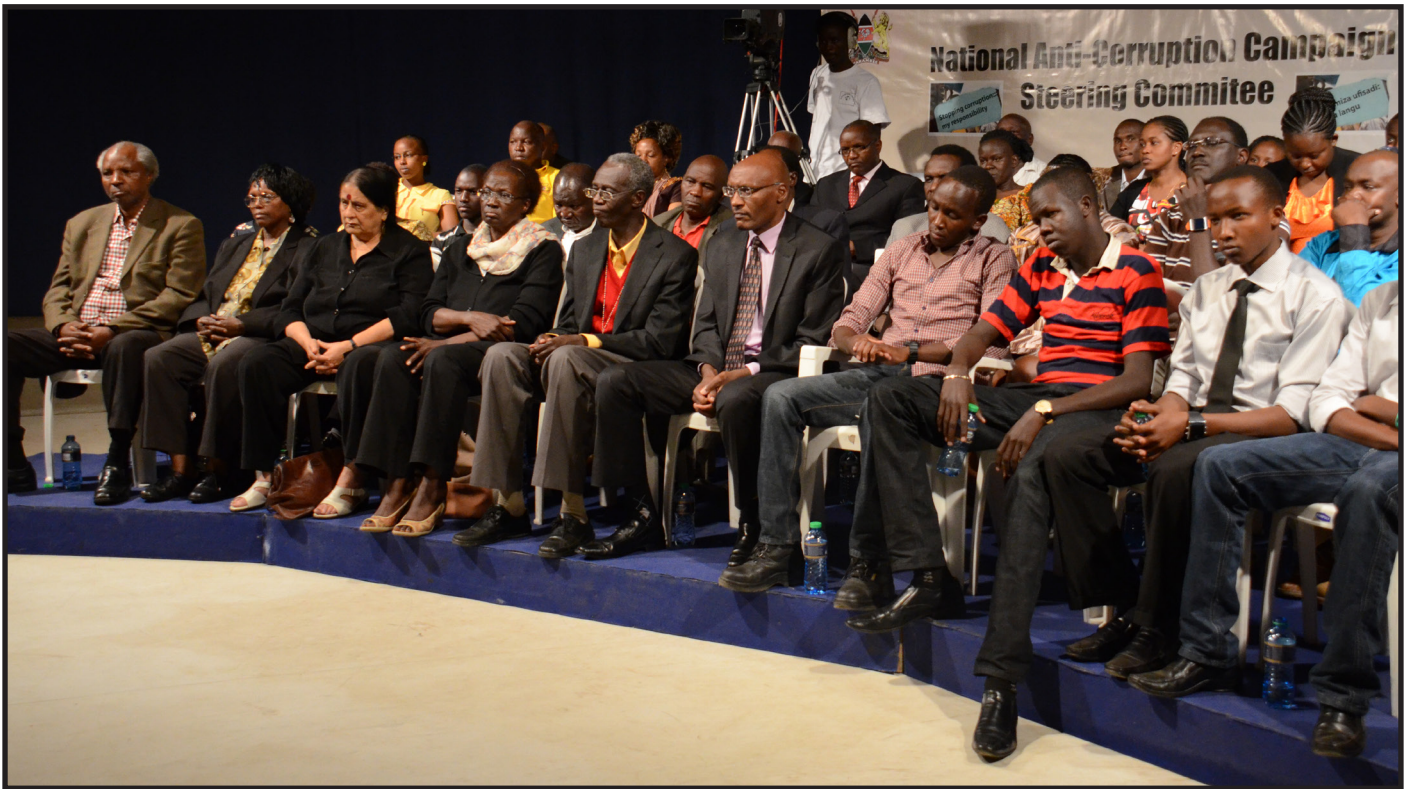
Participants during the “Moving The Masses” programme at the Kenya Broadcasting Corporation, Nairobi.

Due to public demand, Season Four of the exciting, interactive multi-media anti-corruption programme “Moving the Masses” will soon hit the Kenya Broadcasting Corporation (KBC) Channel One television screens. The programme premiered on Sunday, 1st June, 2014 and will simultaneously be transmitted through Radio Taifa every Sunday for the next 13 weeks. The guest list reflects the new crop of leaders that have emerged in the country following last year’s General Elections. Based on the theme “Fighting Corruption: My Responsibility!” (“ Kuanga-miza Ufisadi: Jukumu Langu! ”), the one-hour interactive programme will feature a new segment that will dwell on values as espoused in Chapter Ten of the Constitution of Kenya (2010).