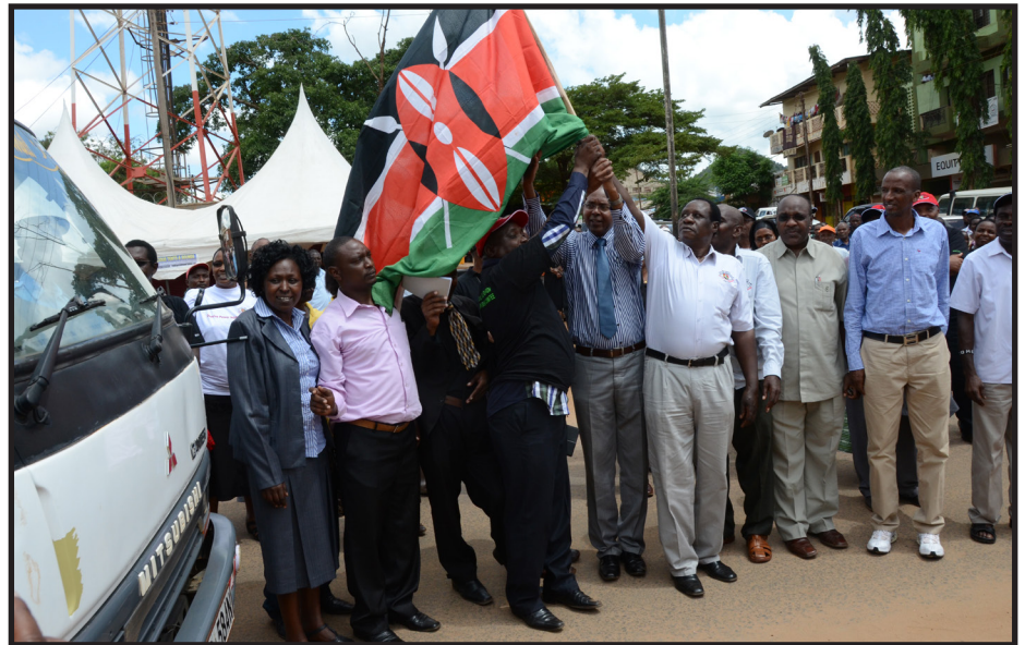
H.E. Eng John Mruttu, Governor of Taita Taveta County flags off a caravan during the launch of the three month Mwanedu FM radio campaign collaboration between NACCSC and the County Government.