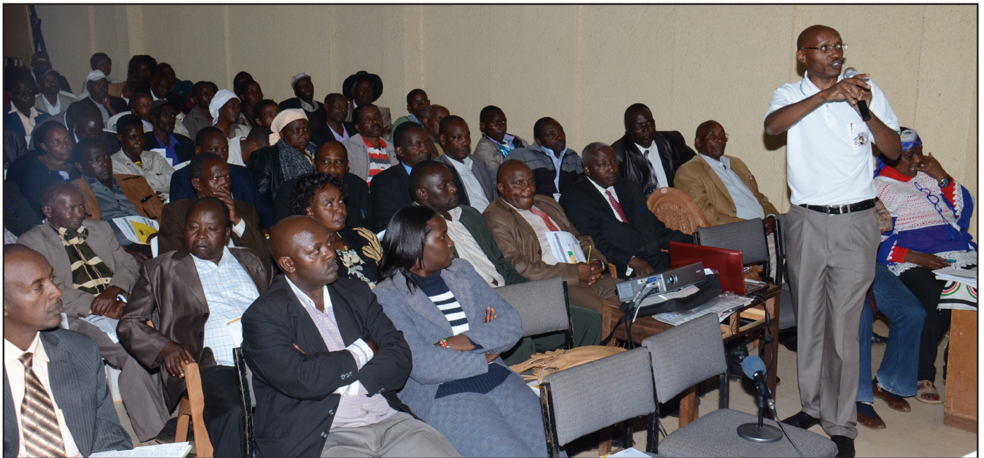
Mr Gathii AG, Director, NACCSC in a Drivers of Public Participation training in Nyeri County. The drivers were being sensitized on what action to take when faced with corruption as they undertake their daily duties.

Nyeri County recently became the first County in Kenya to undertake joint grassroots capacity building and sensitization workshops on corruption prevention in collaboration with the National Anti-Corruption Campaign Steering Committee (NACCSC).