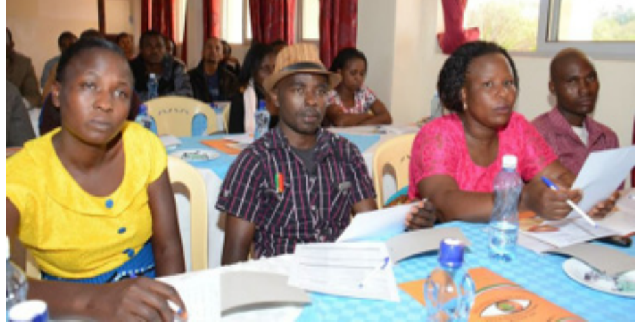
Taita Taveta County youth representatives at the Coast Institute of Technology, Voi

ment's commitment in partnering with NACCSC to ensure corruption does not negatively affect the County's development agenda.