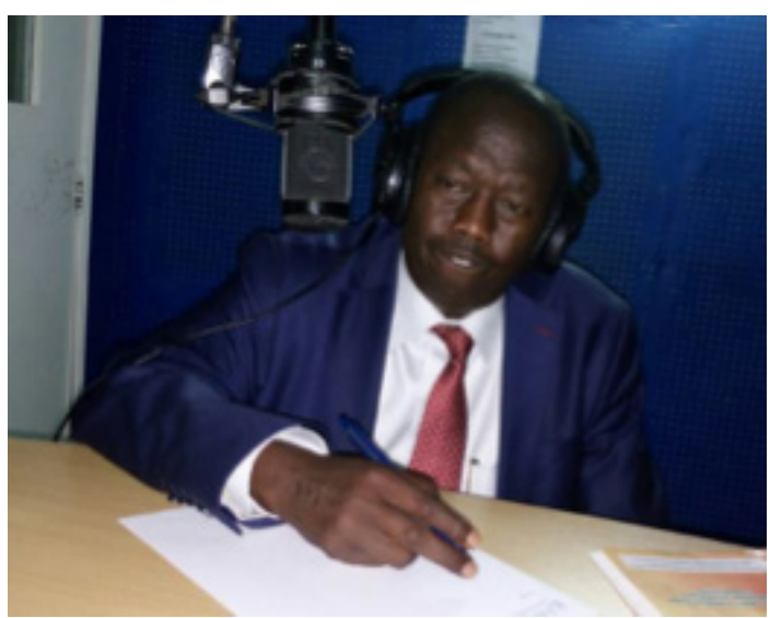
H. E Benjamin Cheboi, Governor of Baringo County